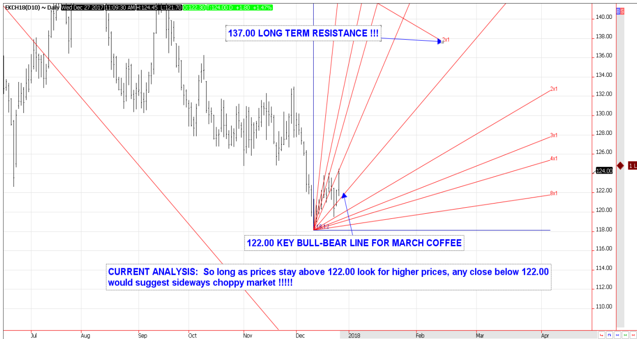
Coffee Futures - Daily